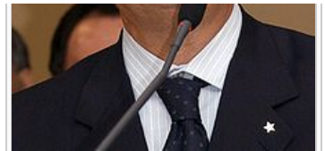
José Dirceu was the Chief of Staff of Brazil when the scandal broke. He was dropped after Jefferson described Dirceu as the ringleader of a plot to hand out illegal monthly payments to congressmen.

On September 25, 2004, Jornal do Brasil published another story claiming that the President of the Brazilian Chamber of Deputies João Paulo Cunha (PT) had promised that he would fully investigate the claims. According to the newspaper, the President of PPS Roberto Freire commented: "This subject has been circulating for months in Congress but nobody has the courage to approach it."