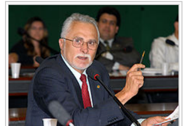
José Genoíno was found guilty of bribery by the Supreme Federal Court for his involvement in the Mensalão scandal.

In regard to the claims initially made by deputy Roberto Jefferson (PTB) the report states: