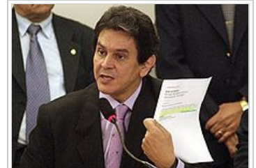
Roberto Jefferson was the whistleblower of the corruption scheme.

Many key advisers to president Lula resigned, while several deputies were faced with the choice of resignation or expulsion from congress, though the president himself went on to be re-elected in 2006.